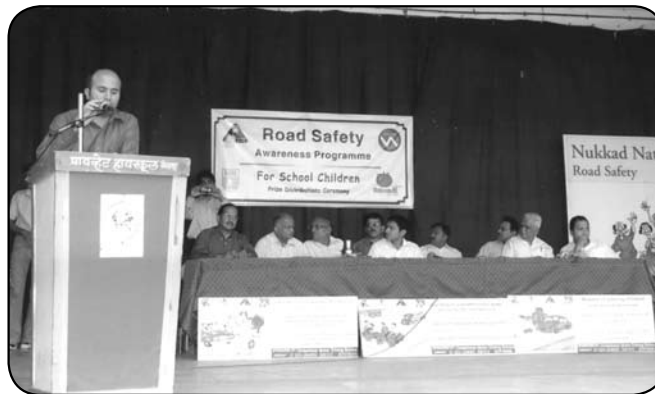
Dignitaries on the dais

The programme received publicity in various local newspapers.