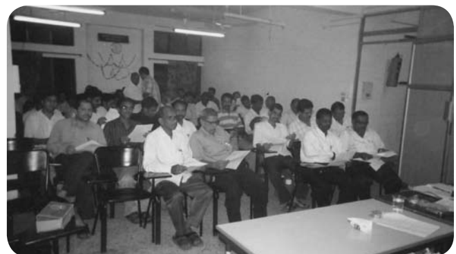
A view of the members at the meeting.