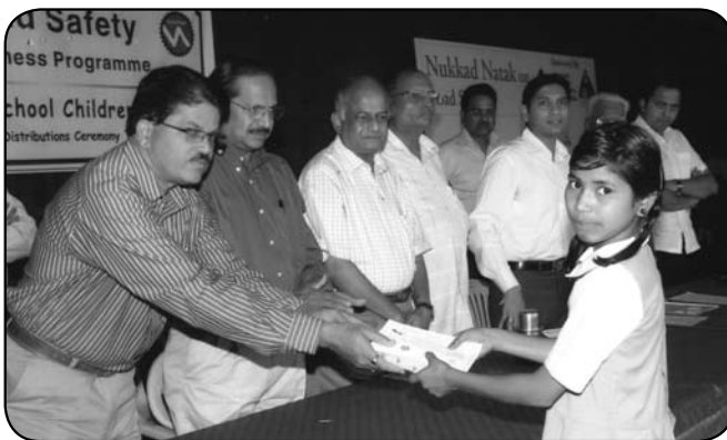
Award of Prizes