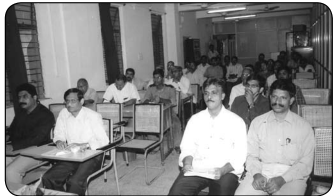
Members at the General Body Meeting.