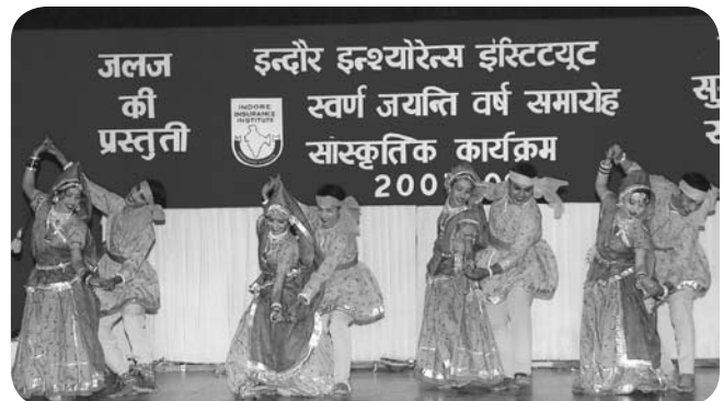
Cultural evening programme by Artists of "Jalaj" group .