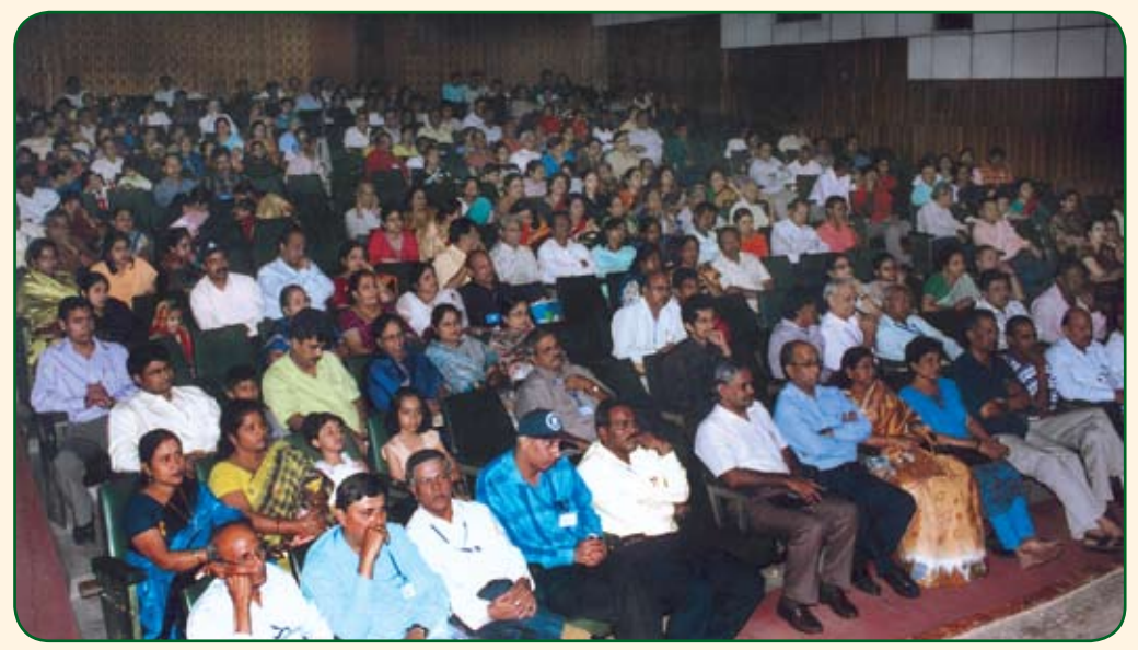
A view of the audience at the Cultural programme.