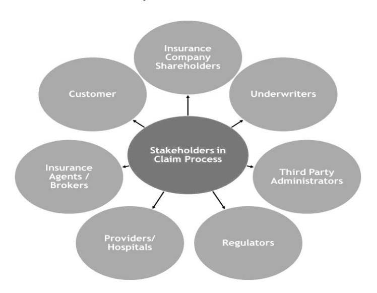
Diagram 1: Stakeholders in claim process

One needs to understand the parties interested in the claims process before looking at how claims are managed.