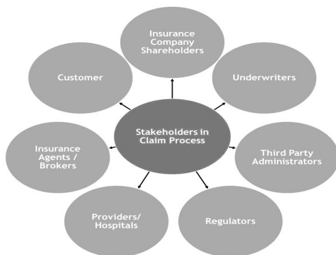
Diagram 1: Stakeholders in claim process

One needs to understand the parties interested in the claims process before looking at how claims are managed.